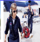
Air or Ground Paramedic