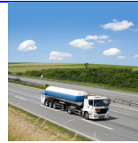
HAZ MAT Driver